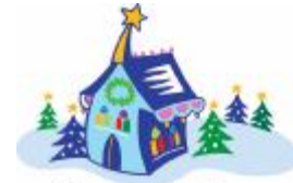
Decorate Trinity Church

DECORATE THE CHURCH Saturday, December 5 9:00 A.M. all are welcome