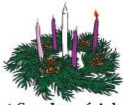
First Sunday of Advent

Sunday, November 29 CELEBRATION OF THE LORD'S SUPPER 10:00 A.M.