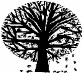
Cold Weather Tree

THE COLD WEATHER TREE!!! The weather outside is telling us that we need to start to collect MITTENS, GLOVES, HATS, SCARVES, SWEATERS and COATS for our friends at Eastside Ministries in Chester. We will be collecting your warm winter clothes from November to mid December. Coat trees, baskets, and a trunk will be in the hall for you to leave your warm fuzzies. You just can't believe how much these gifts mean to the people receiving them! Eastside Ministries thanks you again for helping with their winter needs. The CE Committee