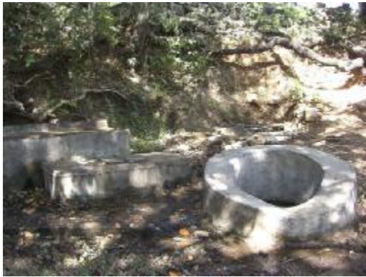
Wells in Morocopay